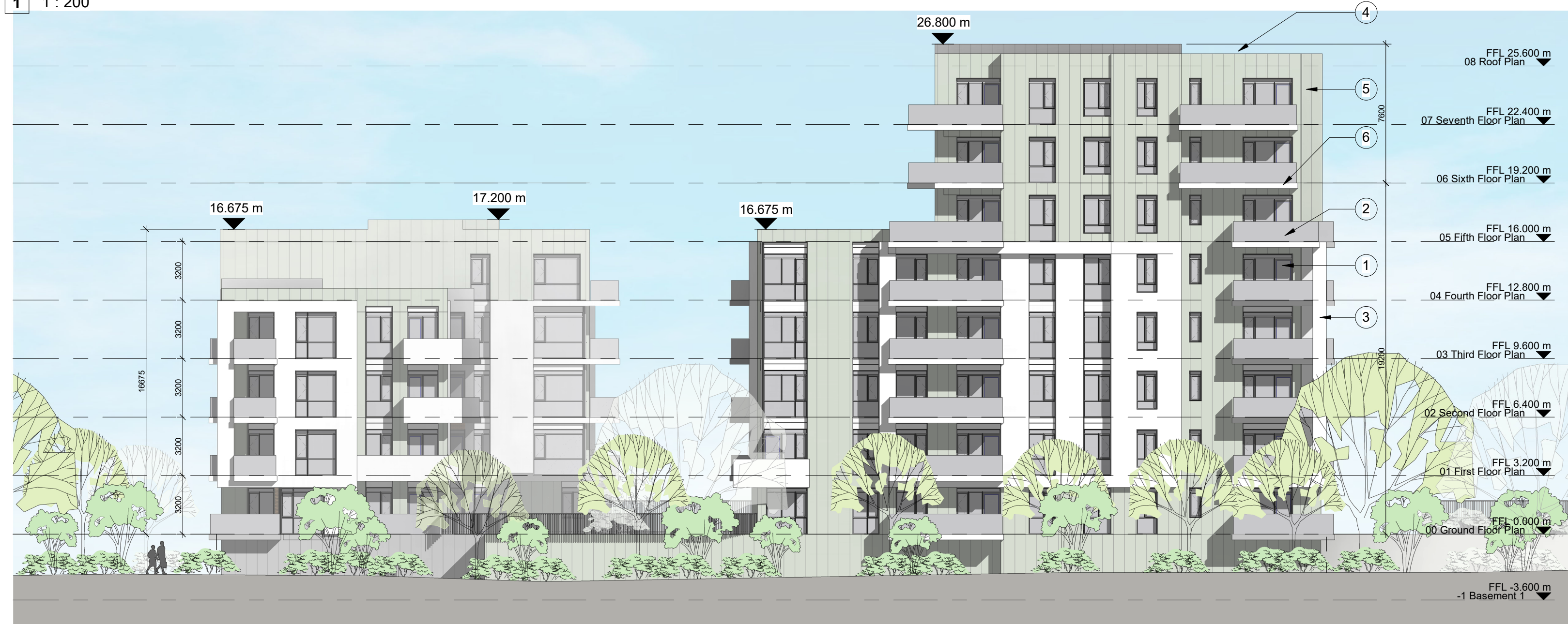
Elevation 3 East Elevation