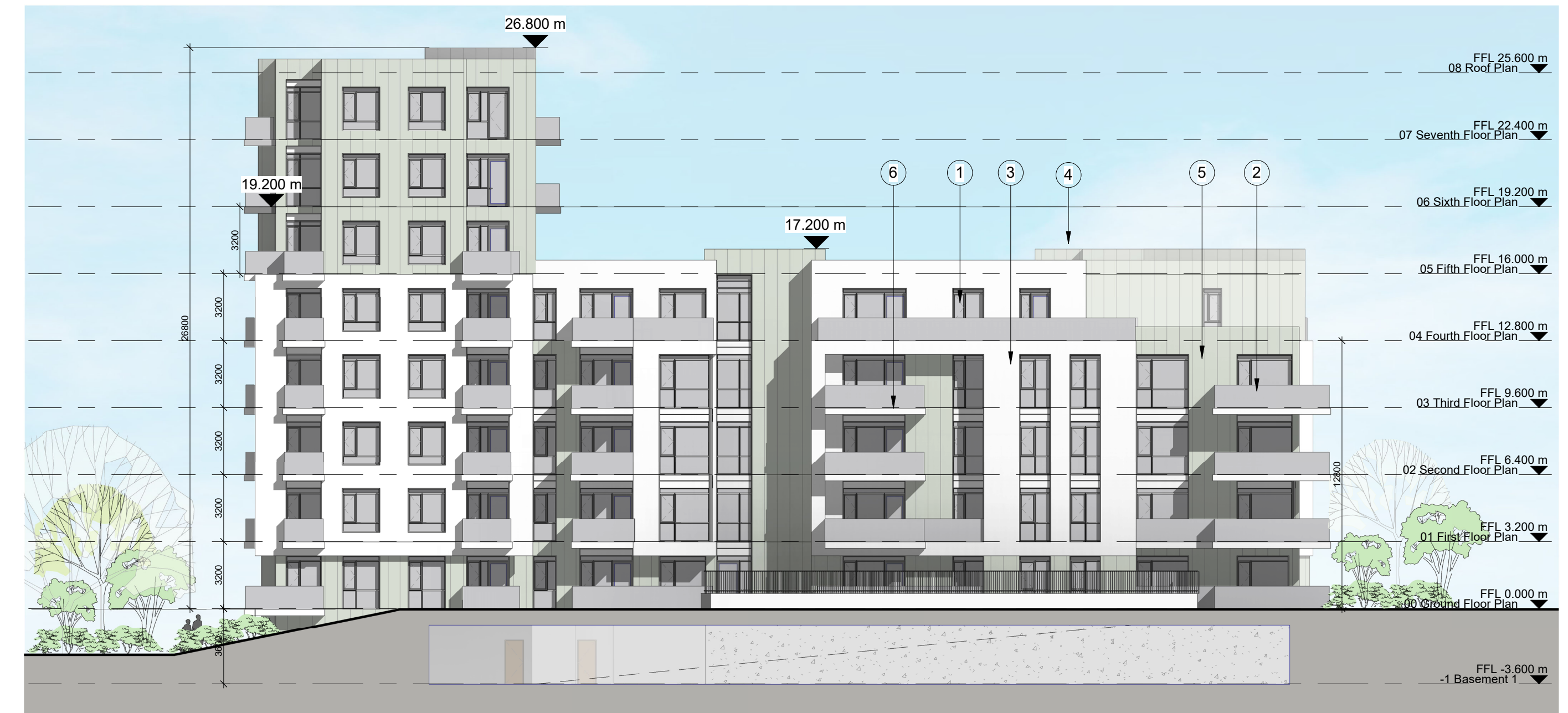
Elevation 2 North Elevation