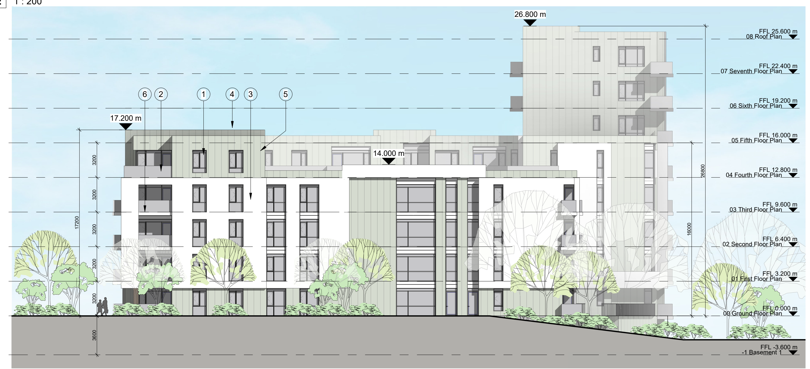
Elevation 4 South Elevation